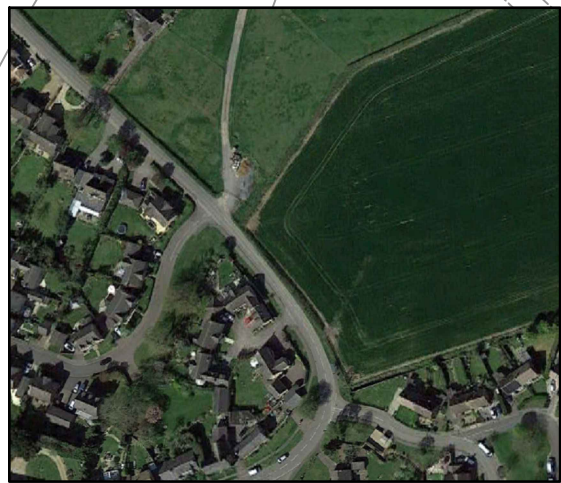
NORTH SOUTH AERIAL VIEW