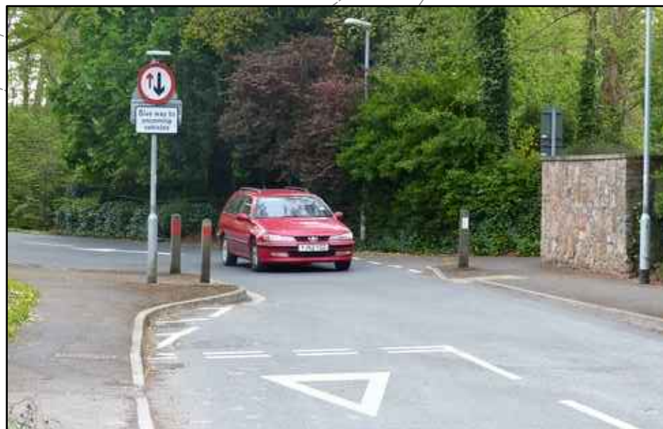
Example of Priority Give-Way Arrangement with Crossing Point.