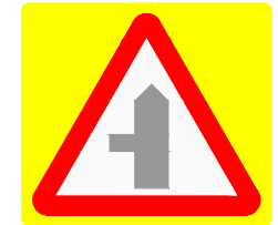
DIAG 506.1 LEFT