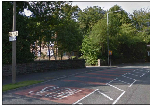
RED BAR MARKING EXAMPLE