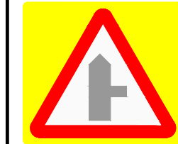
DIAG 506.1 RIGHT